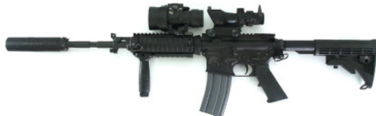
Tactical Night Sight® (TaNS®) shown on M4 Assault Rifle

Detect a Vehicle: In Starlight up to 2120 meters In ¼ Moonlight up to 2590 meters