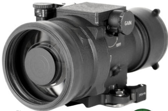
TaNS® shown with MUPPS™ detached from main housing