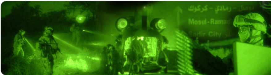
Above images were taken using genuine Star-Tron® Night Vision Products (MK-880 Camera Kit) and a Nikon D2 Digital SLR Camera.