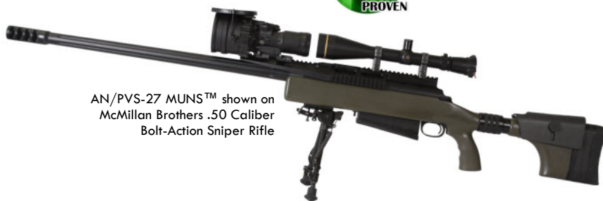
AN/PVS-27 MUNS™ shown on McMillan Brothers .50 Caliber Bolt-Action Sniper Rifle

AN/PVS-27 MUNS™ Gen 3 1250 FOM Image Intensifier NSN: 5855-01-547-9489 P/N: 55837