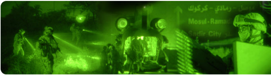
Above images were taken using genuine Star-Tron® Night Vision Products (MK-880 Camera Kit) and a Nikon D2 Digital SLR Camera.